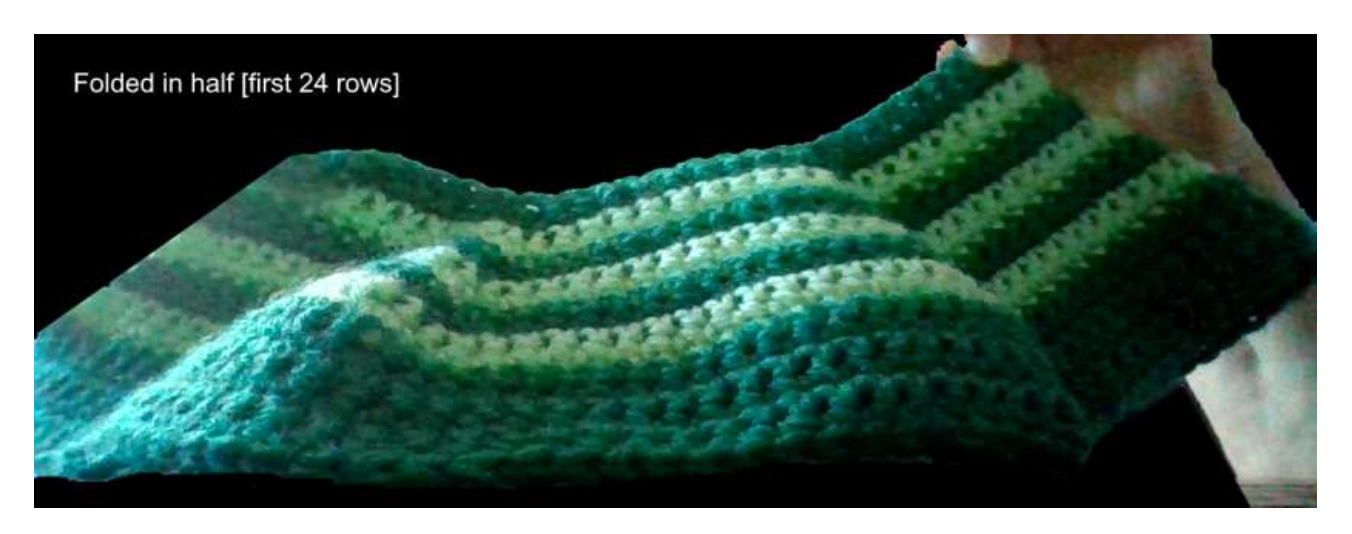
This is what it looks like at this point [only not folded over].

Rows 13-18 Sc in each sc across; ch 1, turn. (126 sc) [This is 6 rows]